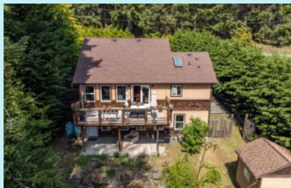
Sunny South Facing