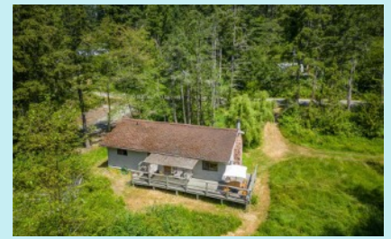
Sunny private island home