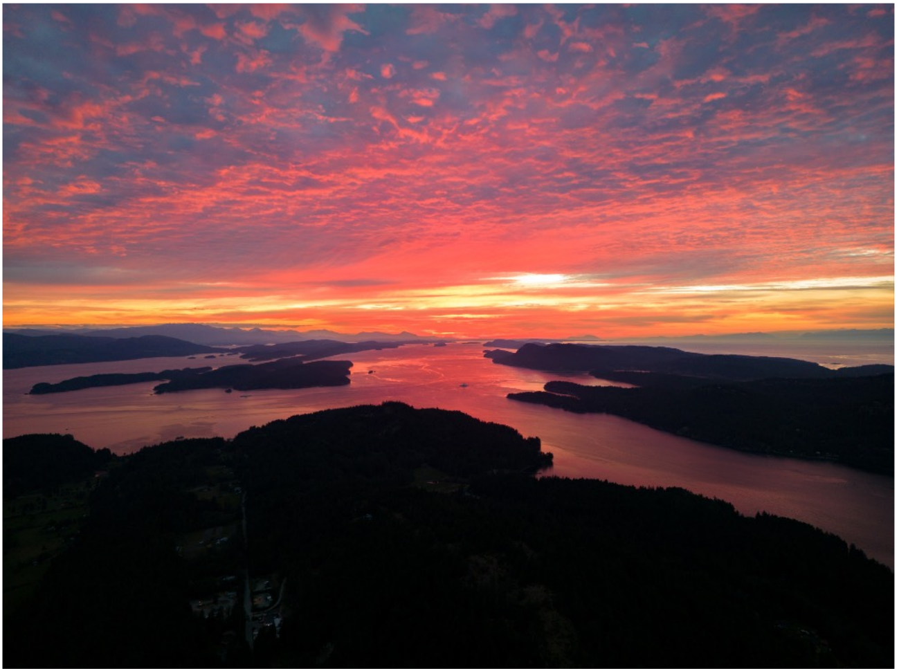
Trincomali Channel - seen from above Port Washington - Pender Island