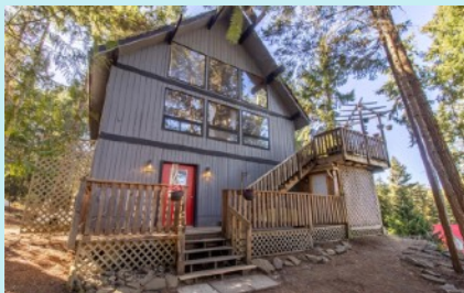
Fantastic Family Home