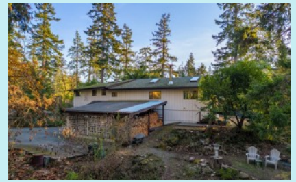
Sunny Hilltop Home