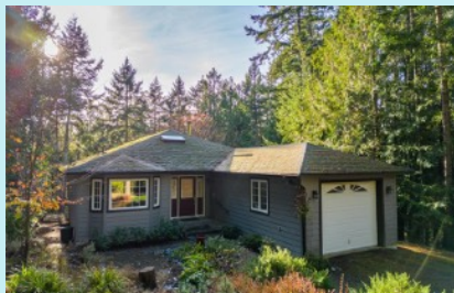
Picture Perfect Rancher