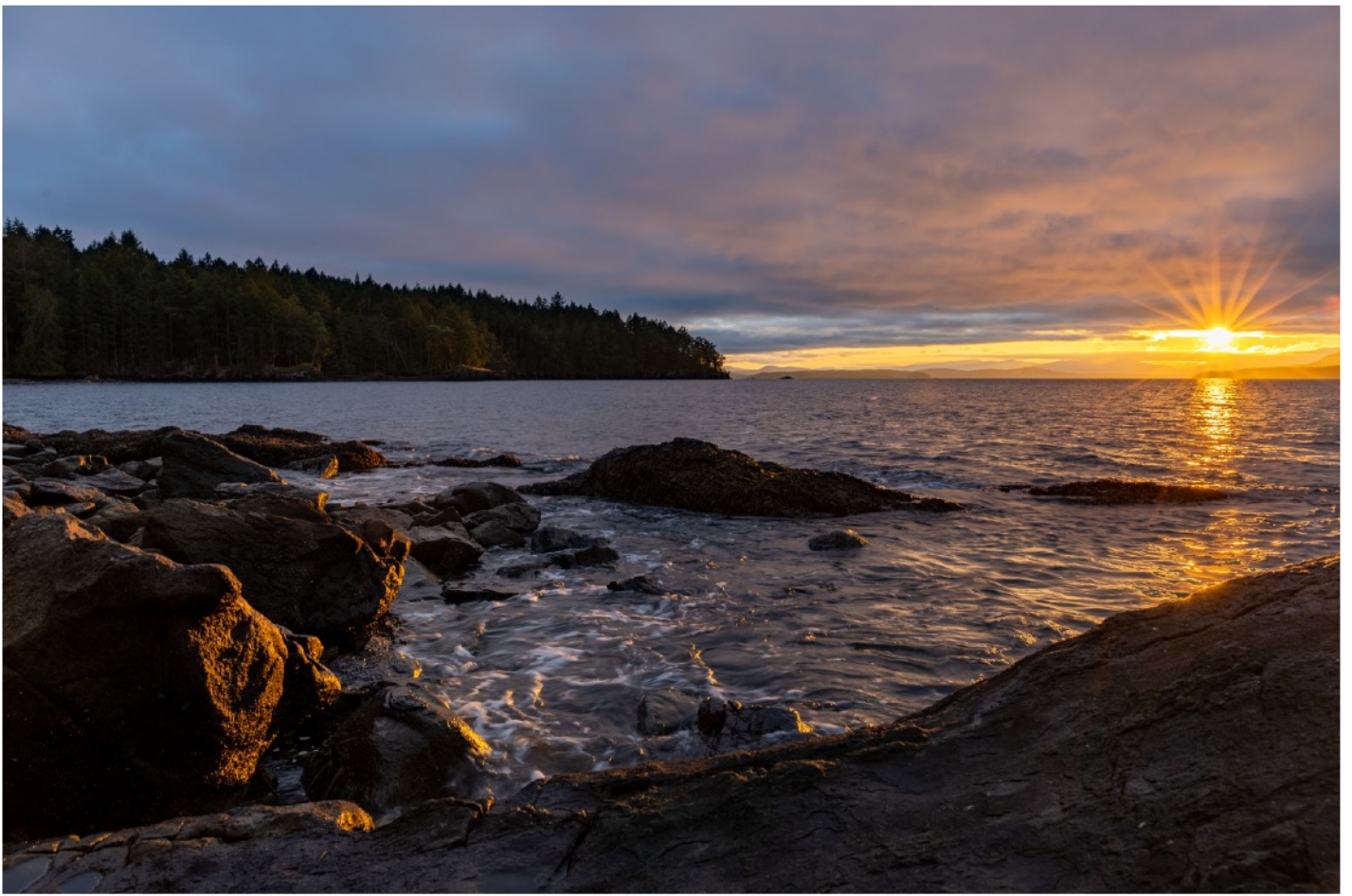
Winter Sunset from Roesland