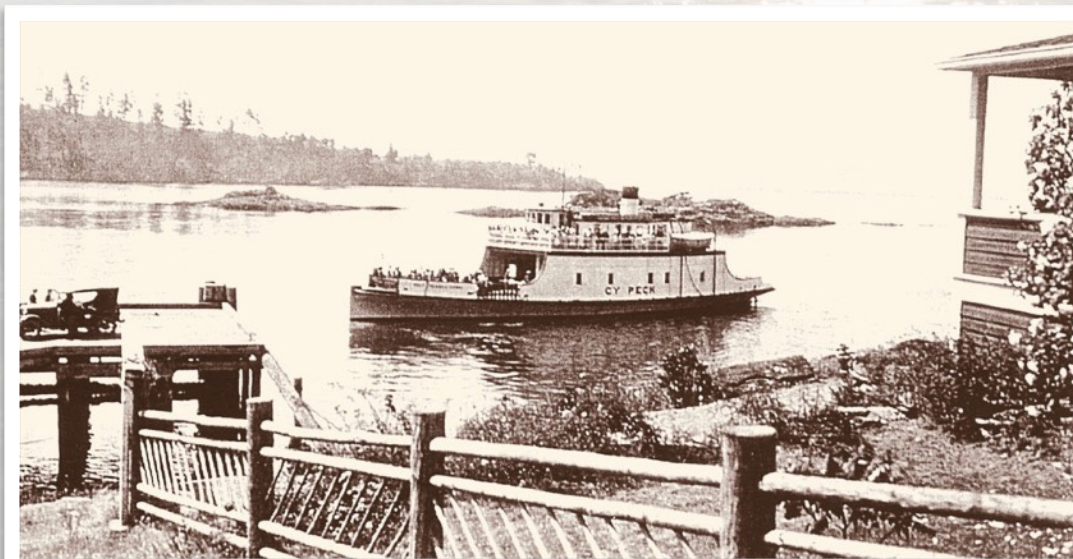
The Cy Peck ferry at Port Washington, served the Gulf Islands for over 30 years until it was replaced in the early 1960s.

Follow us on social media to see more photos and videos and stay up to date with new listings