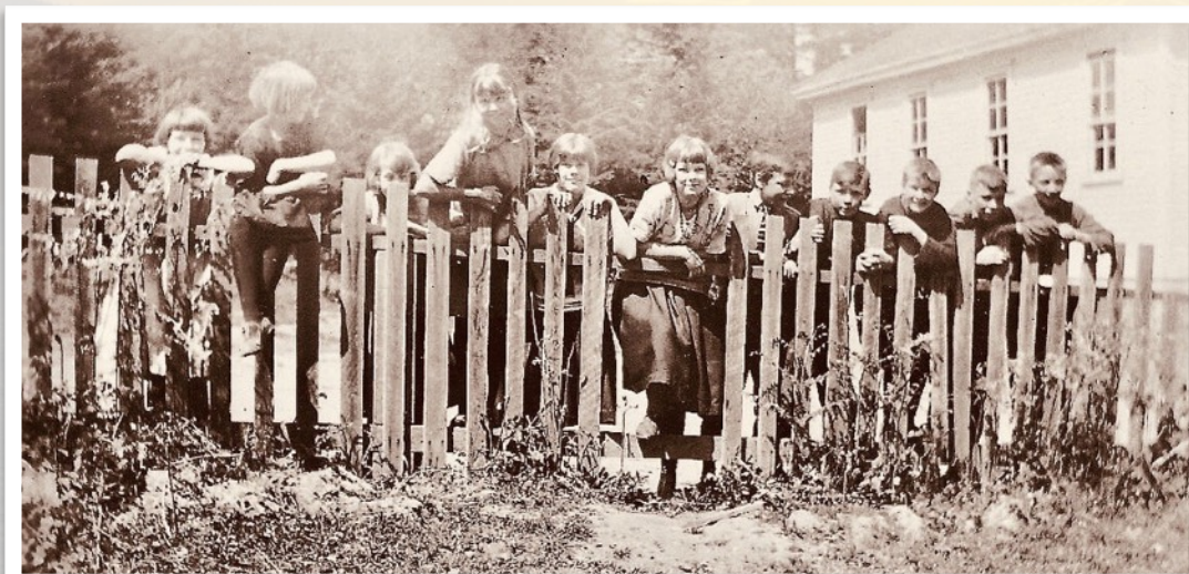
Recess at the original 1902 school on North Pender Island; today's NuToYu thrift store

The pictures below can be found on the website of the Pender Island Museum .