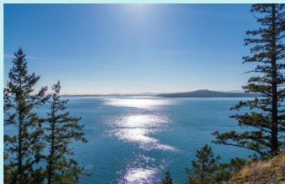
Breathtaking ocean views