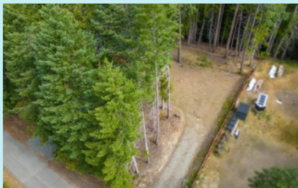
Prepped building lot