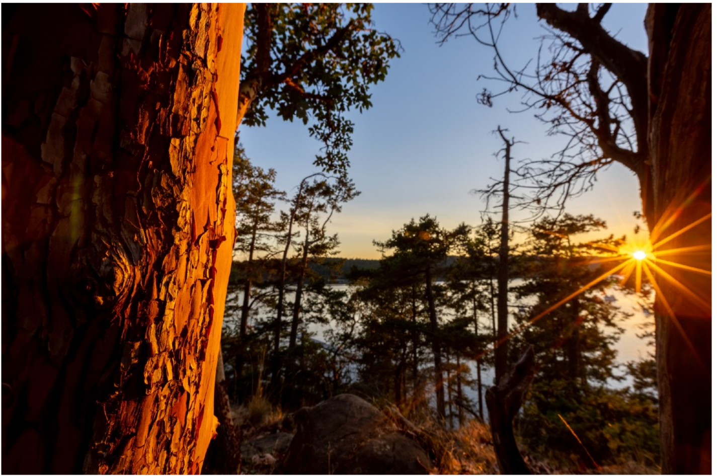
Sunset from the Enchanted Forest