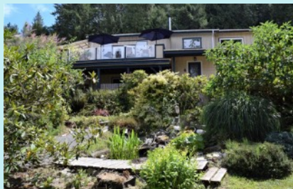
Fabulous oceanview home