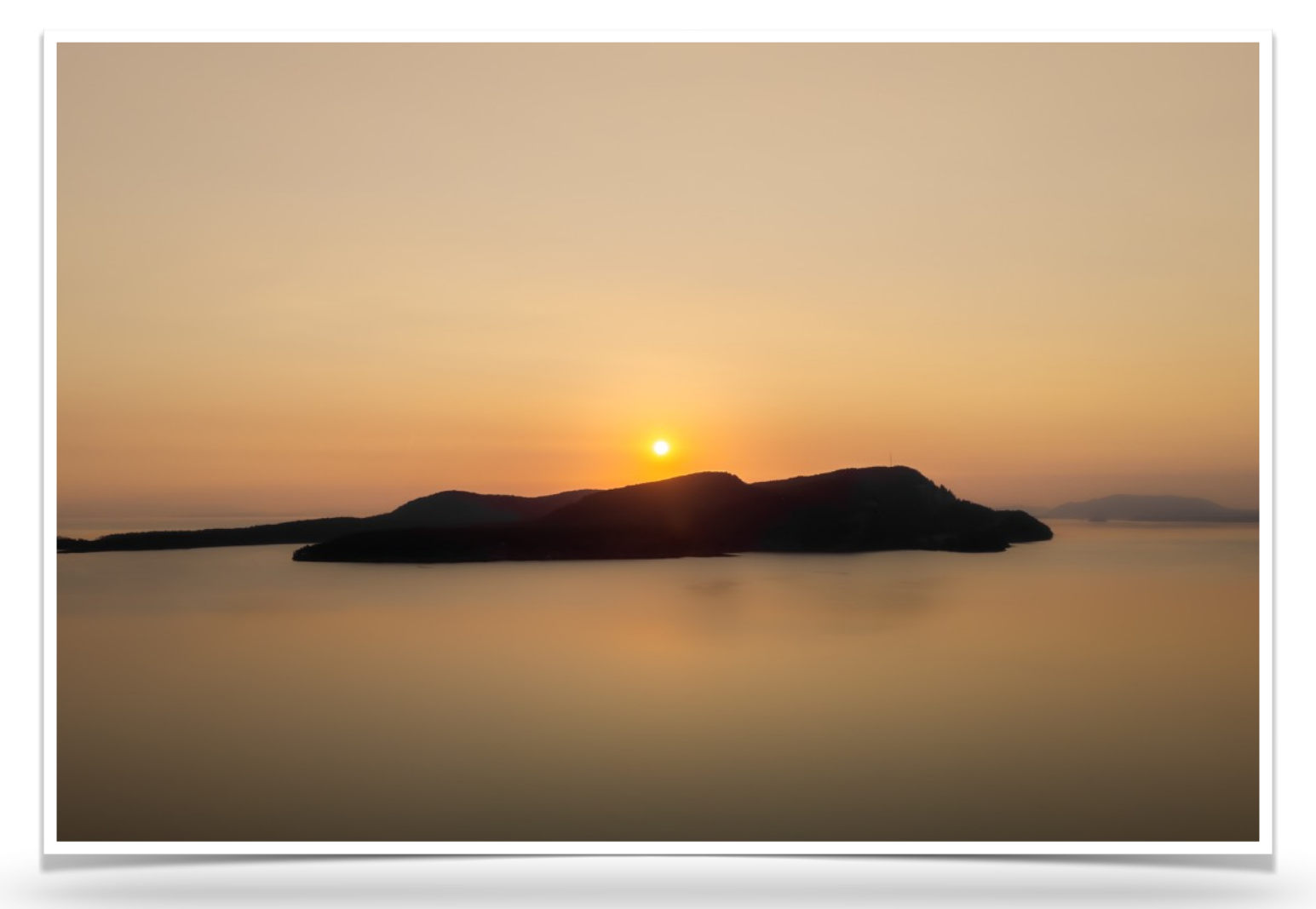
Sunrise over Saturna Island - Seen from Mt. Menzies on Pender Island