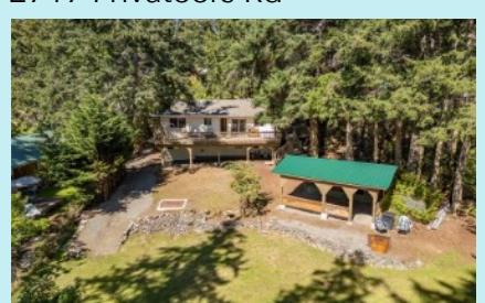
Easy one level living