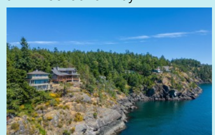
South facing oceanfront