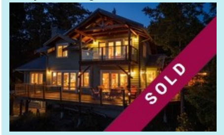
1617 Storm Cr