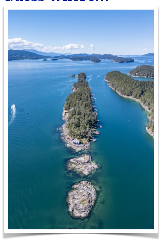
Do you know which boat-access-only island this is?