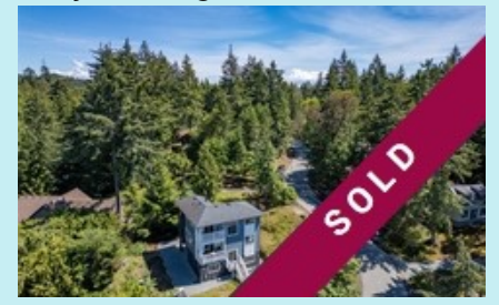
2658 Galleon Way