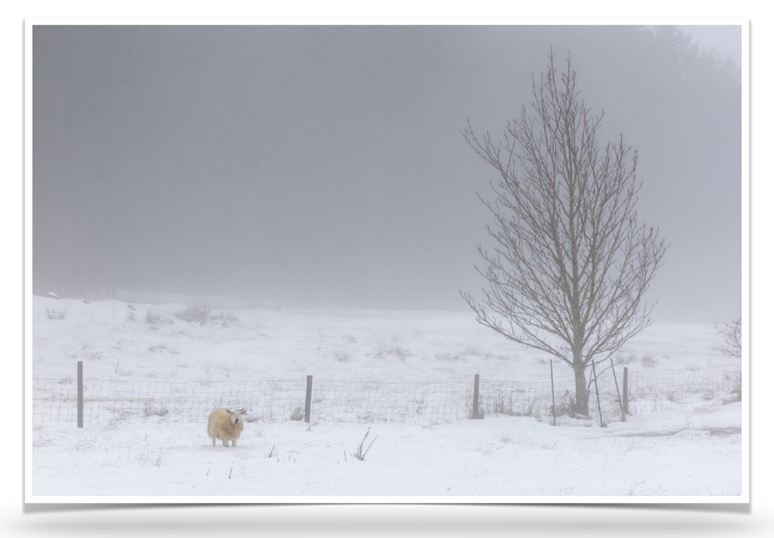
Sheep in the snow on Port Washington Rd - Pender Island