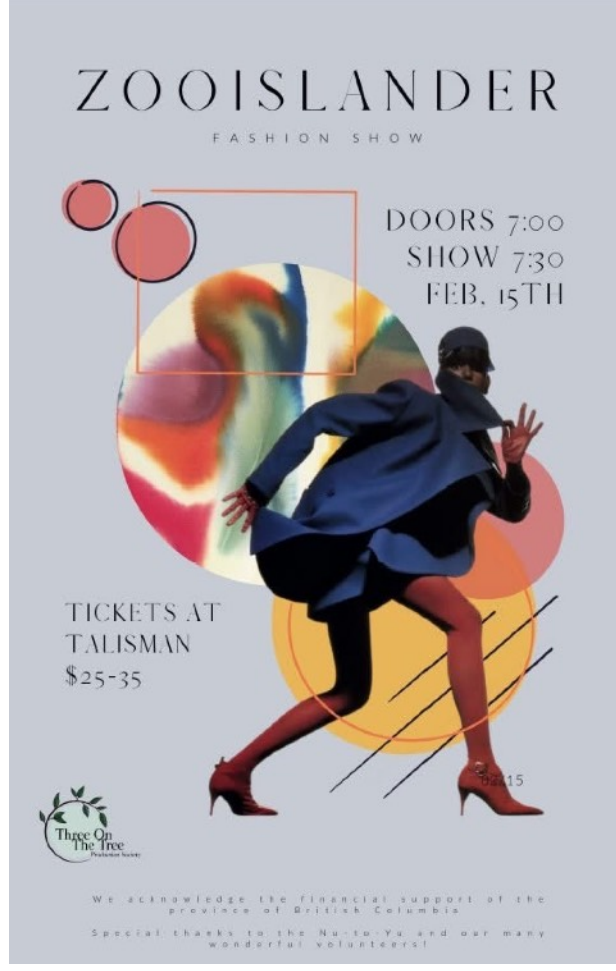
For a full calendar of events check: <a href="https://www.penderpost.org/calendar">https://www.penderpost.org/calendar</a>