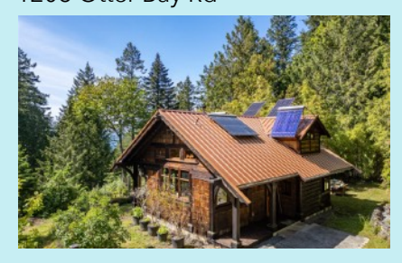
Custom Cottage on 5.43 Acres