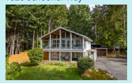
Home with a view