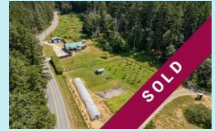
2337 Otter Bay Rd