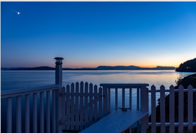
7941 Plumper Way