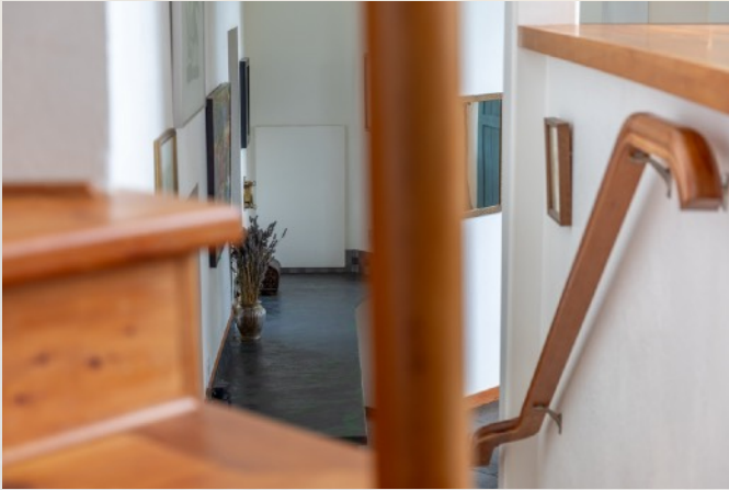
2737 Anchor Way

Most real estate photos are taken with a wider angle lens to showcase the rooms properly without distorting the view. Some photos however focus on details, a view, bits of architecture, or capture a vibe. Here are a few of those highlighted.