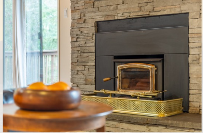
2628 Gunwale Rd