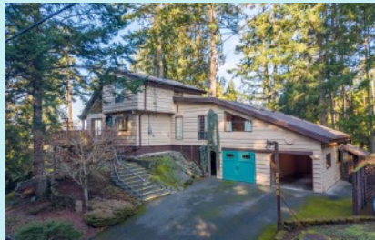
Immaculate Island Retreat