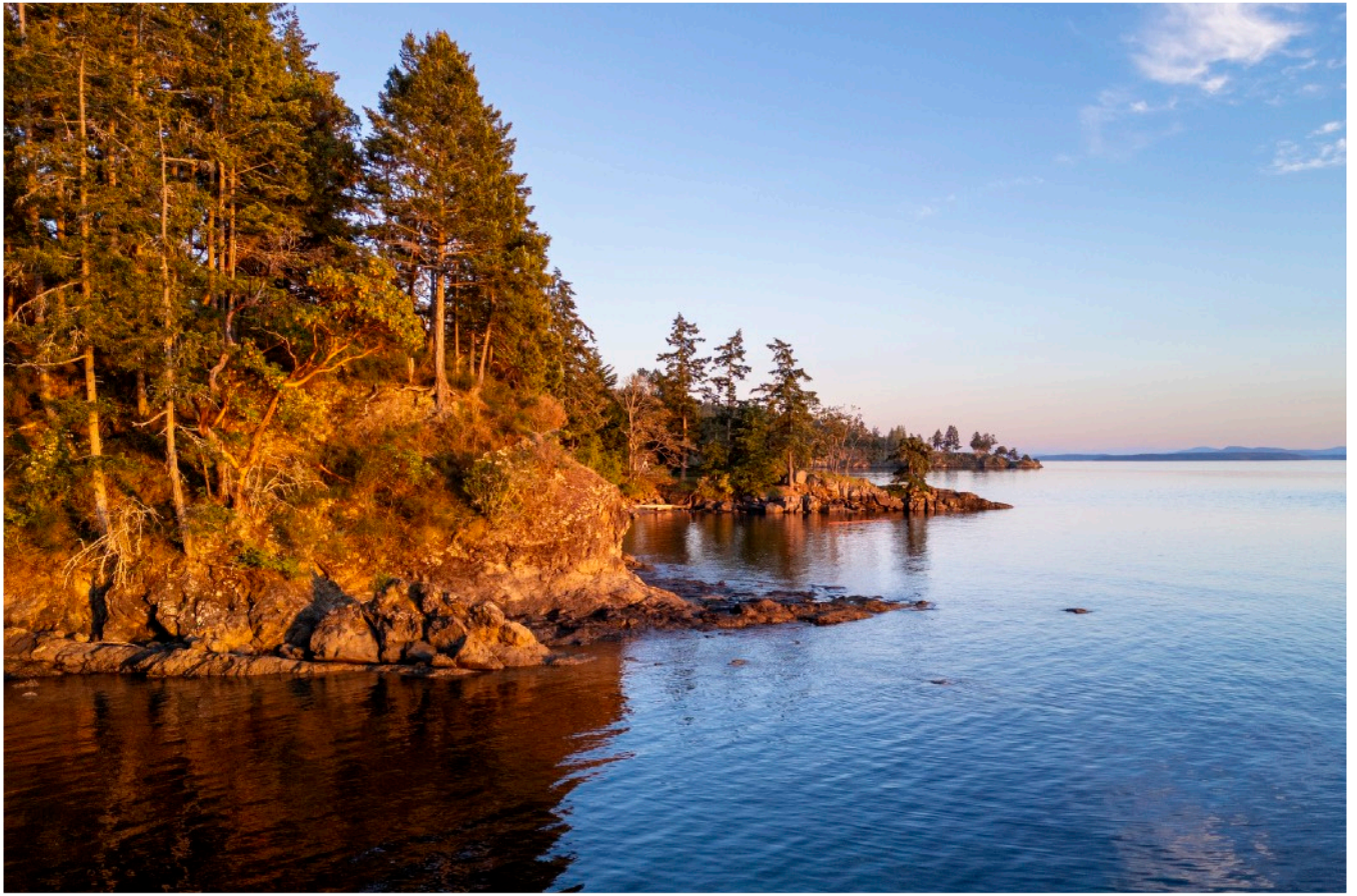
The Bays from Stanley Point to Willey Point, and James Point