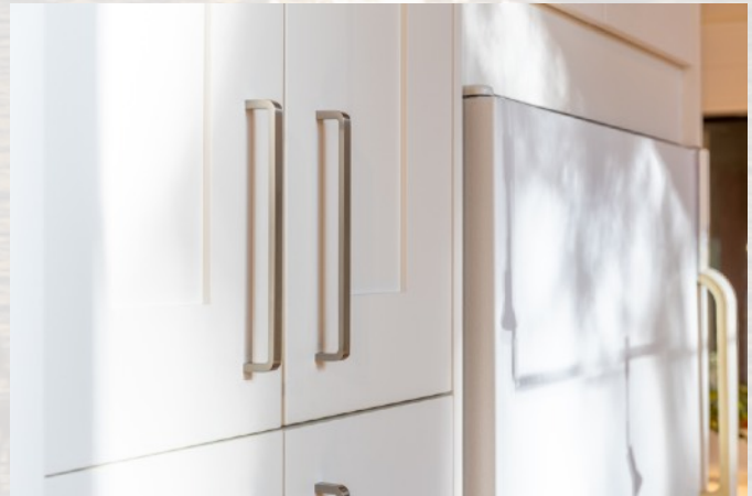
3708 Bosun Way

Follow us on social media to see more photos and videos and stay up to date with new listings