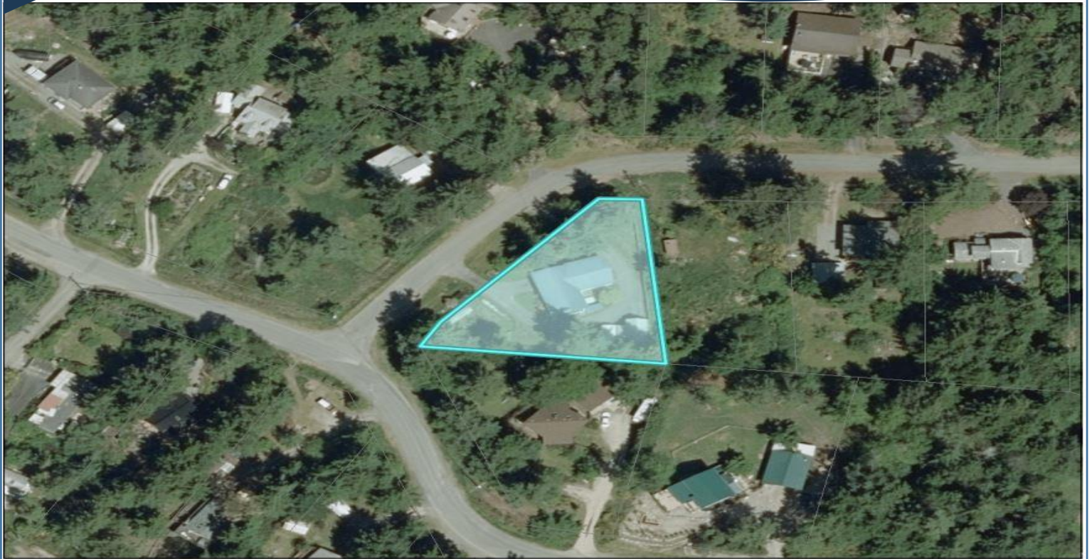
Aerial - 3709 Rum Road