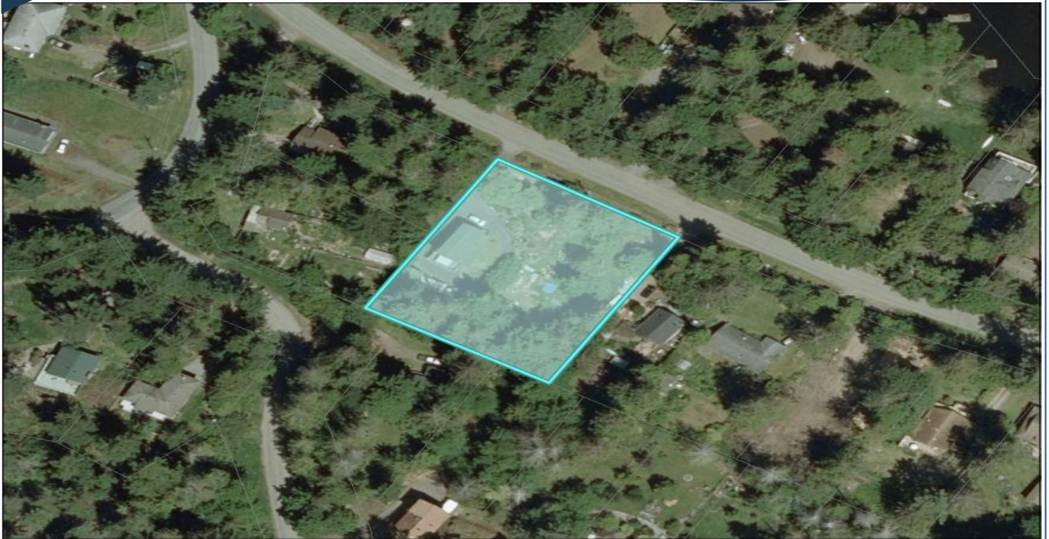
Aerial - 3811 Pirates