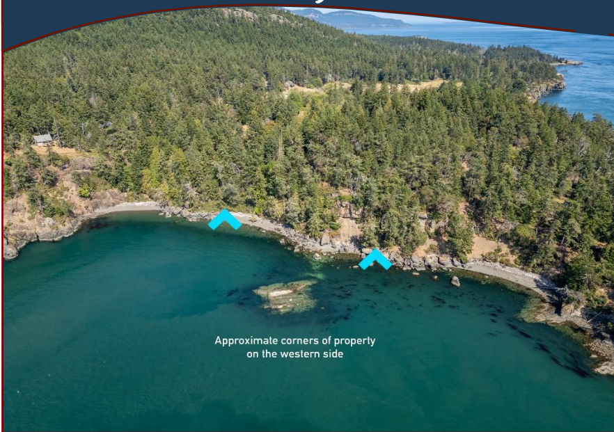
Approximate corners of property on the western side

Superlative Oceanfront Acreage!! Four acres of pristine oceanfront property enjoy Southwest exposure and spectacular views over Boundary Pass, Swanson Channel & the Olympic Peninsula. This amazing parcel presents a rare opportunity to create your dream estate on idyllic South Pender Island. Surrounded by nature you will enjoy complete privacy in peaceful harmony with the environment. Zoning allows for principal dwelling, self-contained cottage & auxiliary buildings. Property is accessed via a quiet country lane with public beach access approximately 100 meters nearby. Driveway roughed in to choice of two excellent, level building sites poised to provide magnificent vistas and sunsets. Bring your vision and create a legacy to last generations! Needs well & septic. All viewings by appointment only please.