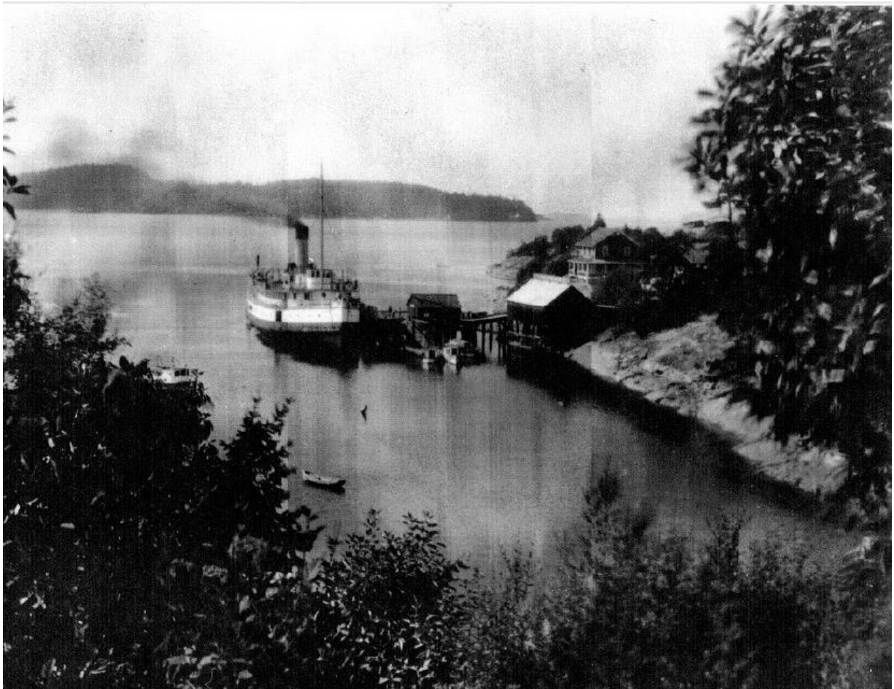
"PRINCESS MARY", Port Washington dock early 1930's, arrived twice a week on Pender, "Boat Days" *View of the Grosvenor House on the right

** This corner was the hub of the Port Washington community. The ferries used to come into the dock, the old Grosvenor House offered rooms for travelers and the General Store and Post Office serviced the community until 1988. The doctors house on the corner, this neighboring cottage, and the beautiful orchard flowing down to the sea have been lovingly maintained as Island Heritage Sites. Walking down to the docks to meet the float plane bringing family members from afar, conjures memories for us, and also for our forefathers and what they might have felt walking the same path, arriving by ferry or small rowboat.