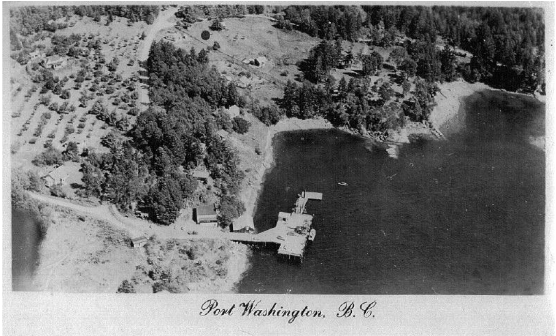
"OLD ORCHARD FARM" and "PORT WASHINGTON DOCKS, (1891)", 1214 Bridges and 1204 Pt Wash" properties shown, centre left, ~ 1940