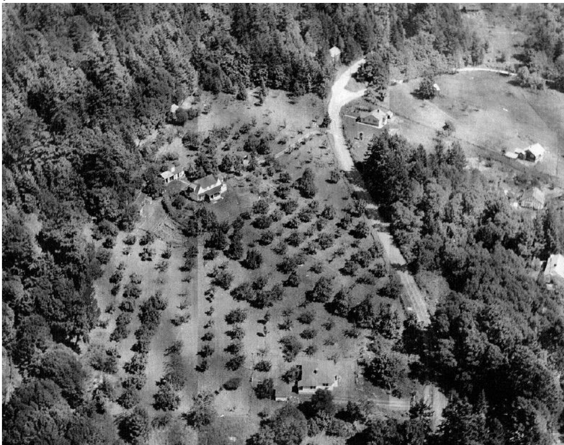
"OLD ORCHARD FARM" with 1204 PT. WASHINGTON" property at centre bottom, ~ 1942