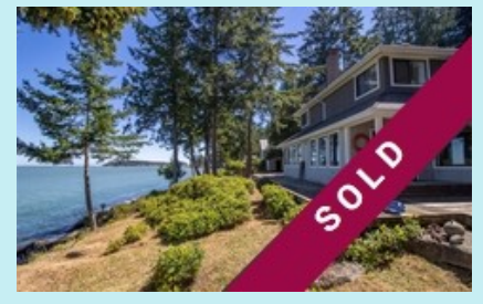
431 East Point Rd