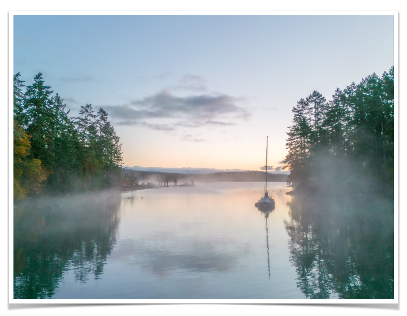
Hope Bay in the morning