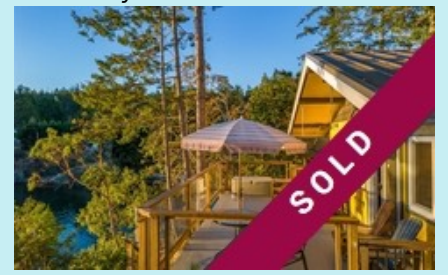
37157 Schooner Way