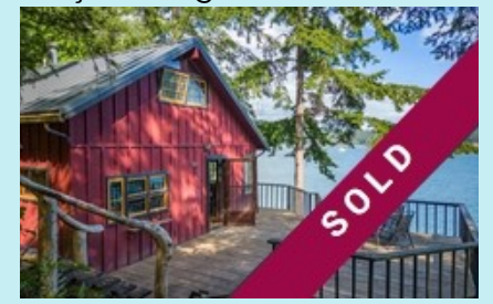
6904 Pirates Rd