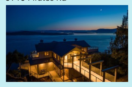
Premium Oceanfront Estate