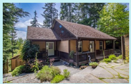
Sunny South Facing Home