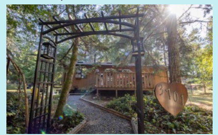
Adorable Magic Lake Home