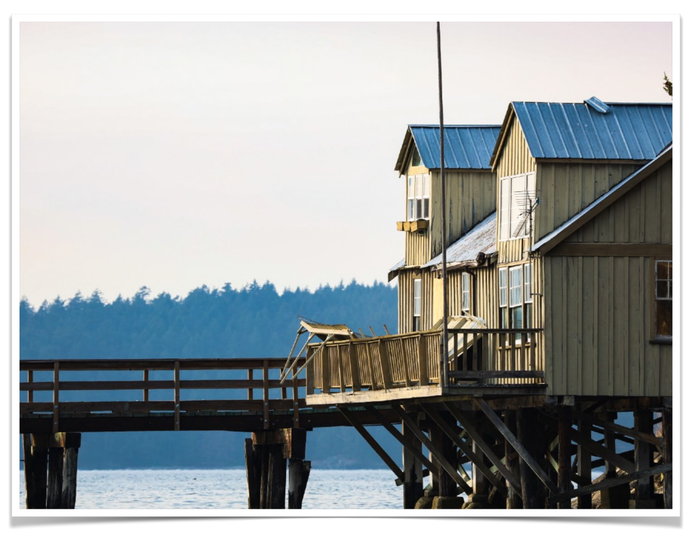
"The Shed" at Port Washington