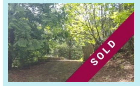
4559 Bedwell Harbour Rd