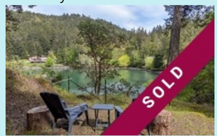
2612 Harpoon Rd