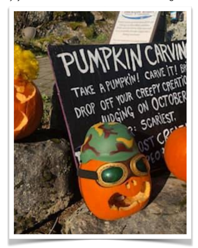
For a full calendar of events this month check: <a href="https://www.penderpost.org/calendar">https://www.penderpost.org/calendar</a>

https://www.facebook.com/hopebaystore). Pick up a pumpkin to carve, decorate, and return so everyone can enjoy them. Prizes for winners in various categories!